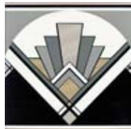
6480 Fan tile